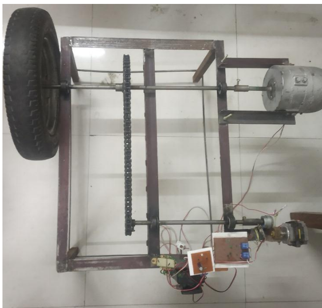
Fig -1: Quarter model vehicle with Regenerative Braking System