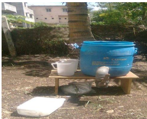
Fig -2: Model of filtration unit

Here in this graph, COD removal efficiency is increased after 3 rd batch and it increases up to 66%. It means charcoal filtration technology works after 3 rd batch of sample.