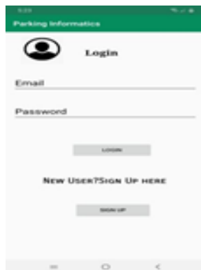
Figure 3.3: Authenticating client details into server

Once the user registers, he can use his email id and phone number to login in the future. This authenticates the user.