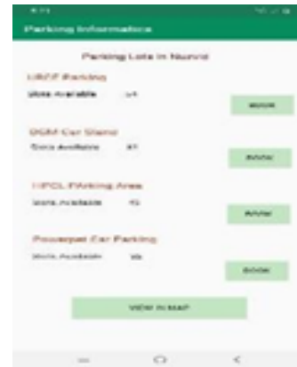
Figure 3.5: Confirmation Screen

On the successful reservation, a confirmation page with user details is shown which is not editable.