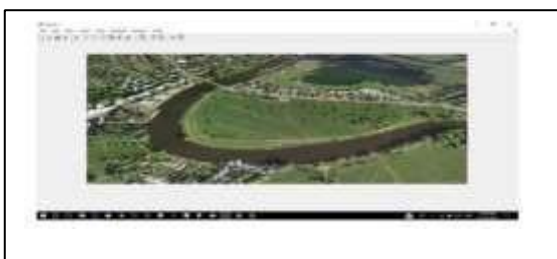
Fig 2. Before Flood Image

The data respective to the area affected (figure 2 and 3) by flood will be taken in prop tables. Once the segmentation is done and the area is analyzed using flood fill algorithm, approximate result is calculated. The resultant data will be plotted in graph as shown in the below figure 4. The values give the approximate results providing the area affected from flood in respective units.