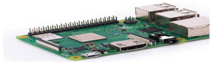
Fig 3.1 Raspberry-Pi 3-Model B+

The dual-band wireless LAN comes with modular compliance certification, allowing the board to be designed into end products with significantly reduced wireless AN compliance testing, improving both cost and time to market. The Raspberry Pi 3 Model B+ maintains the same mechanical footprint as both the Raspberry Pi 2 Model B and the Raspberry Pi 3 Model B.