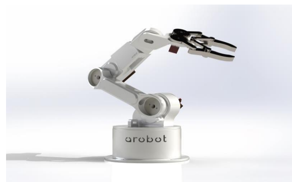
Fig - 1: Arm of Robot [1]

The arm of a robot as an important part of the robotic architecture. Most of the robotic arms resemble the human hands having fingers, wrists, and elbows. A servomotor is used to actuate the arms.