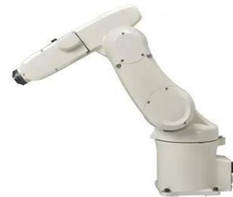
Fig - 5: Articulated Robot[5]

Articulated - This robot design features rotary joints and can range from simple two joint structures to 10 or more joints. The arm is connected to the base with a twisting joint. The links in the arm are connected by rotary joints. Each joint is called an axis and provides an additional degree of freedom, or range of motion. Industrial robots commonly have four or six axes.