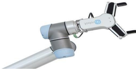
Fig - 2: End Effector of Robot[2]