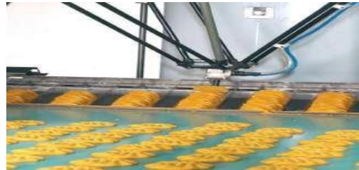
Fig – 10: Delta Robot

Delta - These spider-like robots are built from jointed parallelograms connected to a common base. The parallelograms move a single EOAT in a dome-shaped work area. Heavily used in the food, pharmaceutical, and electronic industries, this robot configuration is capable of delicate, precise movement.