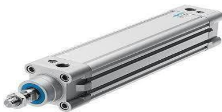
Fig - 3: Actuator of Robot[3]

They are generally muscles of a robot. The actuators mechanism can be achieved by using electric motors/ hydraulic systems/ pneumatic systems, or any other system that can apply forces to the system.