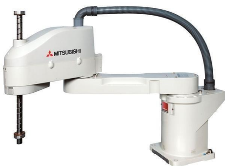
Fig – 9: SCARA Robot

SCARA - Commonly used in assembly applications, this selectively compliant arm for robotic assembly is primarily cylindrical in design. It features two parallel joints that provide compliance in one selected plane.