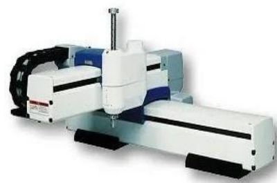
Fig - 6: Cartesian Robot[6]

Cartesian - These are also called rectilinear or gantry robots. Cartesian robots have three linear joints that use the Cartesian coordinate system (X, Y, and Z). They also may have an attached wrist to allow for rotational movement. The three prismatic joints deliver a linear motion along the axis.