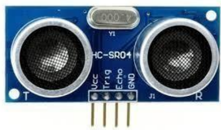
Fig - 4: Sensor of Robot[4]

The sensors are used as a converter that measures a physical quantity and converts it into a signal which can be read by an observer. The Sensors which are used in a robot are vision sensors (Camera), tactile and proximity sensors line sensors, Temperature sensors, light sensors and sound sensors.