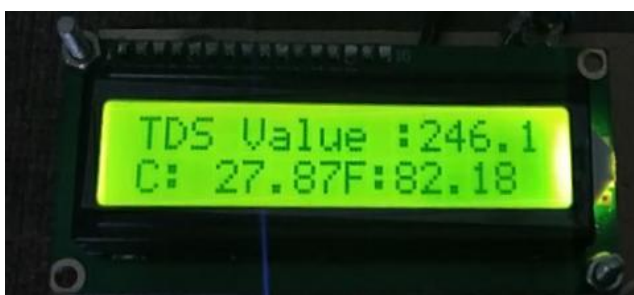
Fig3: Display of TDS and Temperature value