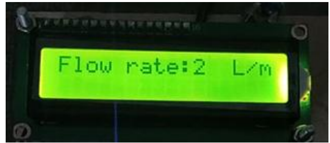
Fig4: Display of flow rate values