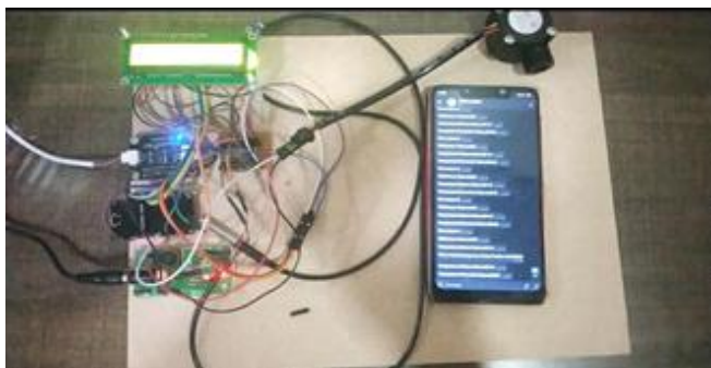
Fig2: sensor interface