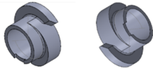
Figure 1.1 Front Cam and Back Cam

Torsion springs: Can be found on clipboards, underneath swing-down tailgates, and, again, in car engines. The ends of torsion springs are attached to other things, and when those things rotate around the center of the spring, the spring tries to push them back to their original position.