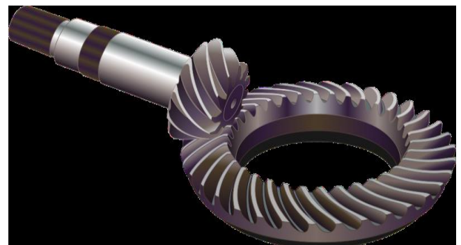
Fig 1 Spline Bevel Gear

In conventional machining there was a problem associated with chain dropping due to misalignment of rear wheel sprocket and wheel. To avoid such consequences, we are making chainless bicycle. In chainless bicycle we are running the rear wheel by using driven shaft and ring bearing. bearing play a pivoted role in power transmission. the main of the project is to obtained a maximum displacement of bicycle by transmitting the maximum possible torque from pedal to rear wheel, for a minimum