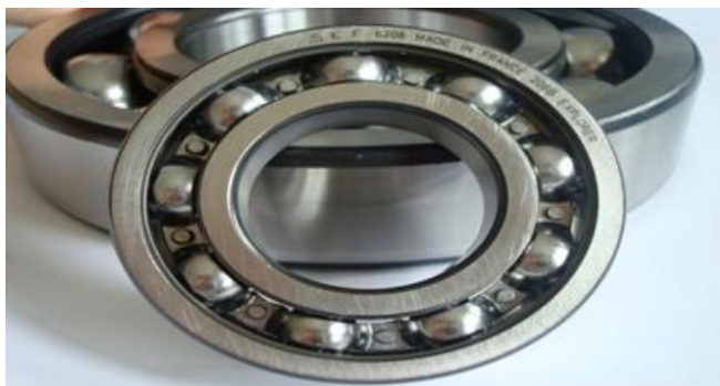
Fig 2 Bearing

A bearing is a machine element that constrains relative motion and reduces friction between moving parts to only the desired motion. The design of the bearing may, for example, provide for free linear movement of the moving part or for free rotation around a fixed axis; or, it may prevent a motion by controlling the vectors of normal forces that bear on the moving parts. Bearings are required for the front and rear axles.