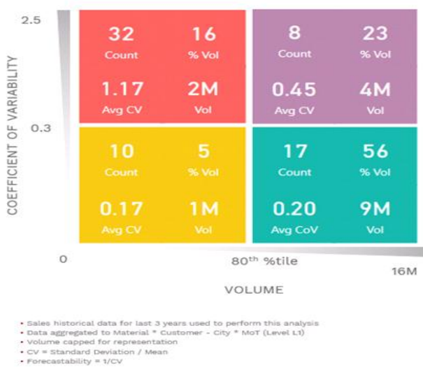
Fig 1.3 Quad Plot