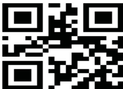
Fig -4: QR code basic structure diagram

In the actual application process, the two-dimensional code encryption system is split into two parts: the generating end and identifying end. The generating end is liable for masquerading and encrypting the two-dimensional code that needs to transmit information, and the identifying end is responsible for restoring the two-dimensional code image consistent with the previously set secret key, and parsing the encrypted two dimensional codes. So as to finish the above functions, it's necessary to determine an algorithm database beforehand, allocate corresponding keys to users of various terminals, and complete decoding by system key matching.