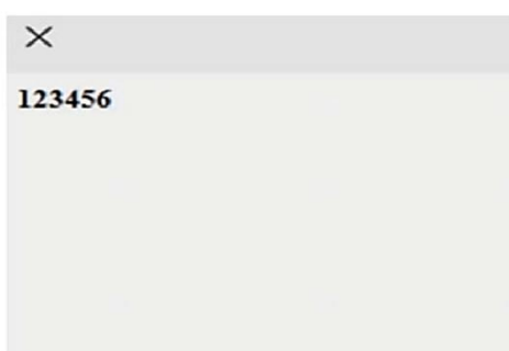
Fig -5: Decrypted QR code