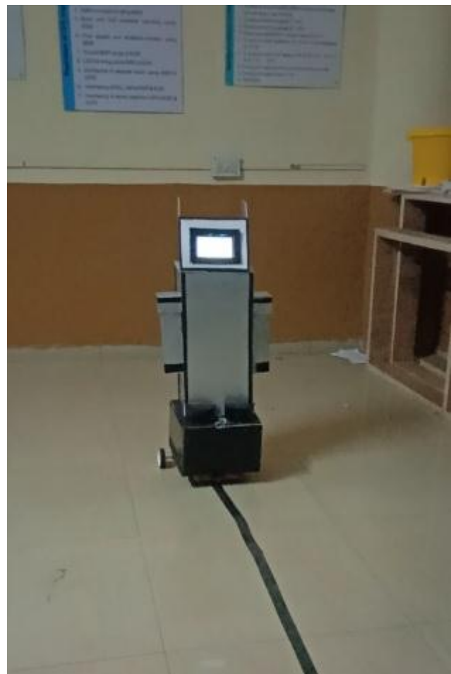
Fig 4: Project module