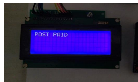
Fig -4: Mode selection