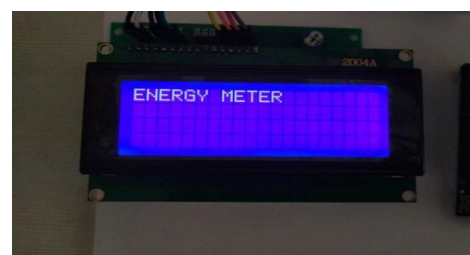
Fig -3: Starting up of meter

Energy consumption is a rising crisis now a day. In most of the cases lack of knowledge or information regarding their usage lead to the wastage of electricity. People are unaware of their usage pattern and need of consuming energy sustainably which in turn paves way for increased billing amounts, load shedding, under production of electricity etc. Our project sees through all the main issues faced by the utility as well as the consumers. The IoT Enabled Energy Management Meter helps in using energy sustainably by making consumers aware of their usage through alert messages. The alert messages are sent via the MQTT platform, using which distant control of appliances are also possible. In the current scenario the real time monitoring of the appliances helps to recognize devices left unnoticed or of no use, so that can be controlled i.e. switched ON or OFF. The alert messages are sent for both Post-paid and prepaid schemes. For Post-paid, it's for the 50%, 90% and 100% of the threshold that is pre-set. On the other hand, for the prepaid alerts are for every 50%, 90% and 100% of the recharged energy. The bills are processed every two months and are sent to the consumers via their phones. The supply is disconnected if the amount is not remitted before the deadline and will only be reconnected after the payment is processed.