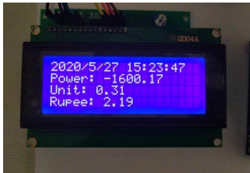
Fig -5: No load output