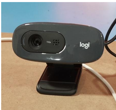
Fig-4. Logitech camera