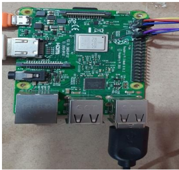
Fig-3. Raspberry pi