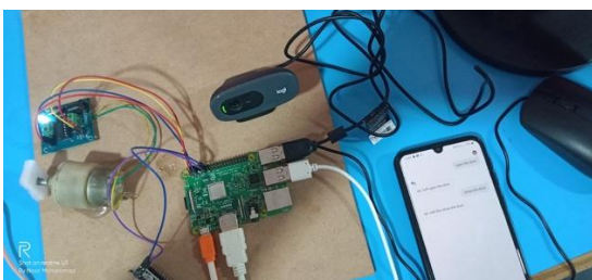
Fig-4. Top view of the project.