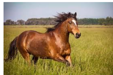
Fig -2: Test Object

Given in Fig. 3 is the output user might get for the provided input in Fig. 2.