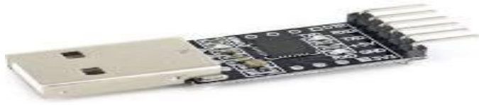
Fig 4.4 FTDI Module