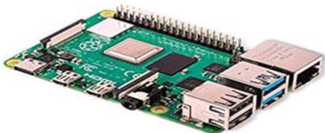
Fig 4.1 Raspberry Pi

4.1 Raspberry Pi: The Raspberry Pi 3 Model B is the earliest model of the third-generation Raspberry Pi. We are used Raspberry Pi Board for making Smart Voting Machine. It has 4 quad processor with 1.2 GHz 64 bit. This model has standard form factor. It uses 26 pins GPIO. Raspberry Pi 3b model uses a Broadcom BCM3837 SoC.