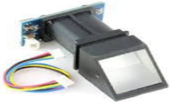
Fig 4.2 Fingerprint Sensor

4.2 Fingerprint sensor: A fingerprint sensor is an electronic device will capture a digital image of the fingerprint pattern. The captured image is called a live scan. MAX232 / USB-Serial adapter. The user can store the fingerprint data in the module of Raspberry pi. The data can configure it in 1:1 or 1: N mode for identifying the person. It is an input device that consist of flash, fingerprint sensor and processor used for fingerprint processing which includes two parts fingerprint enrolment and fingerprint matching when enrolling, user needs to enter the finger two times.