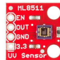
Fig -3: ML511 UV sensor

The ML511 sensor breakout is an easy to use ultraviolet light sensor. The MP8511 UV Sensor outputs an analog signal in relation to the amount of UV light it detects. This sensor detects 280-390nm light most effectively. This is categorized as part of the UVB (burning rays) spectrum and most of the UVA (tanning rays) spectrum.