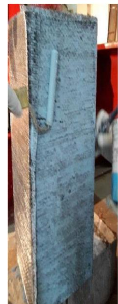
(iv) Wrapping of FRP fabric (v) Rolling to remove air bubbles