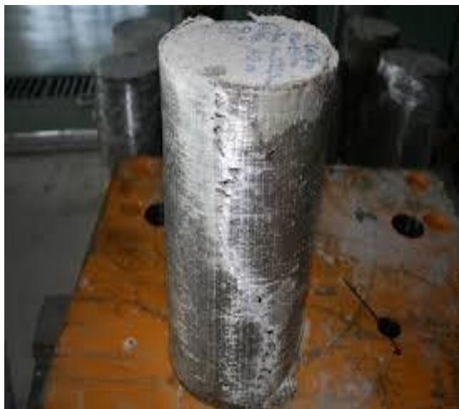
Fig. 2 BEFORE COLUMN WRAPPING