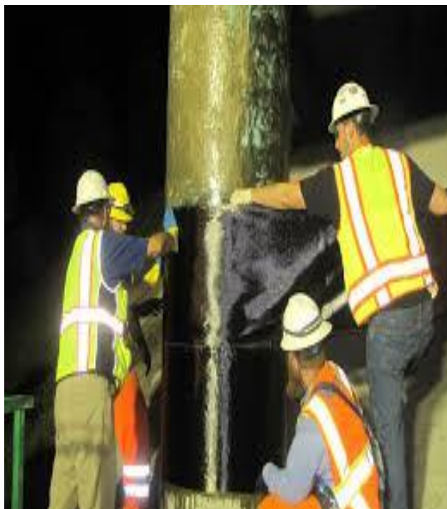
Fig. 2 AFTER COLUMN WRAPPING