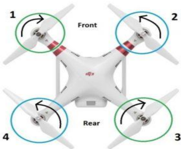
Fig -5: Top View of the Drone [5]

Quadcopters and drones rely solely on the differential speed of the motors driving the propellers. This variation of the UAV offers differential RPM thrust and cruise control present in motor/ propeller speed gives the quadcopter all the required propulsion to fly [5].