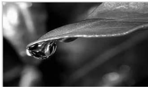
Fig -6: Grayscale Conversion [7]