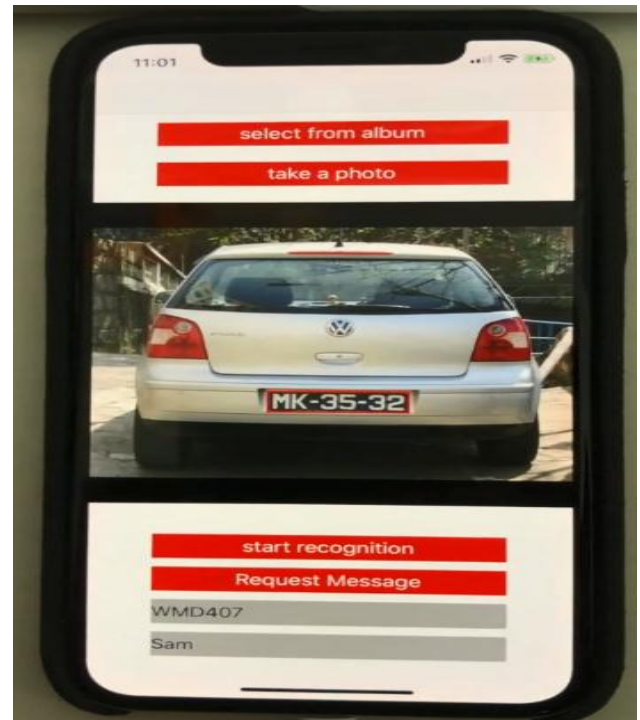
Fig -3: Vehicle plate detection app through image uploading method [4]

The image is first clicked using the camera application of the smart phone. On initiating the recognition process, the license plate is perceived from the captured image of the vehicle and the vehicle number is obtained in the below text field of the smartphone application. In order to get the owner's information, one can request the application to connect to the vehicles database and derive the respective owner's details [3].