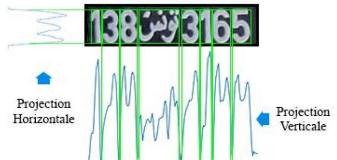
Fig -7: Histogram Image calculation [9]

horizontal direction are calculated, the horizontal projection of the histogram is obtained. The average value of the histogram is used as a threshold to calculate the upper and lower limits. The central area is recorded as the area delimited by the upper and lower limits. We then calculate the vertical projection histogram but by interchanging the rows and the columns of the image to have the two limits of each character [9].