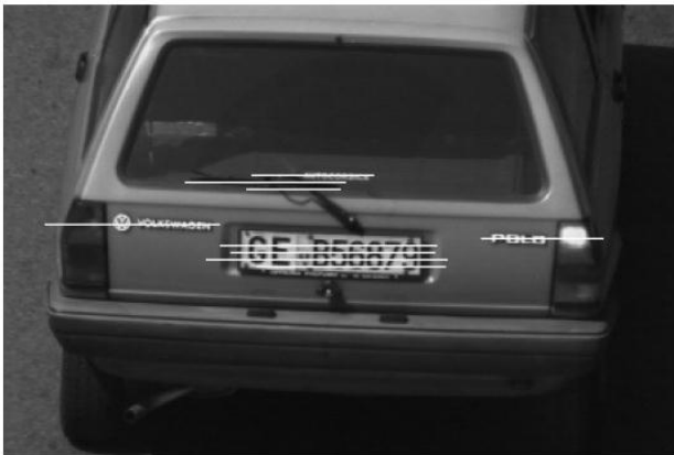
Fig -2: Typical car image with superposed line segments [3]

includes a pre-processing block which performs a screening in order to select images or sub-images showing motion [3].