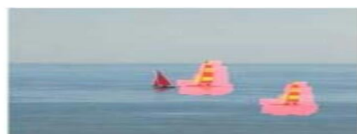
Figure 5.2: Forgery detected in the image of figure 1.2 - Copied and pasted regions are coloured in pink

Result of forgery detection using the exact match technique on the image in figure 1.2 is shown in the figure 5.2.