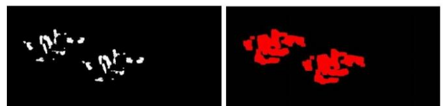
Figure 5.1 : Results of forgery detection of image in the figure 1.1: Exact Match (left) and Robust Match (Right)

The Robust Match algorithm was implemented using MATLAB software. Twenty images obtained from various sources were used for testing the algorithm. Color images were converted into grayscale. Images were resized to 128x128 pixels. Blocks of size of 8x8 pixels were considered. Results of forgery detection of the image shown in the Figure 1.1 using Exact Match and Robust Match methods are shown in Figure 1.6 for comparison. The results are better in the Robust Match method.