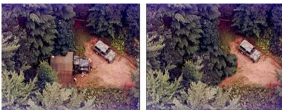
Figure 1.1 : A truck in the original (left) is removed by covering with surrounding foliage

One of the main purpose of image forgery is to conceal an object in the image. Normally the simplest way is to copy another portion of the image and paste it over the object to be concealed such that it blends with the remaining part of the image and leaves no clue of tampering. To cover up any traces of forgery, retouching may be done at the periphery of the pasted object. An example of this kind is shown in figure 1.1.