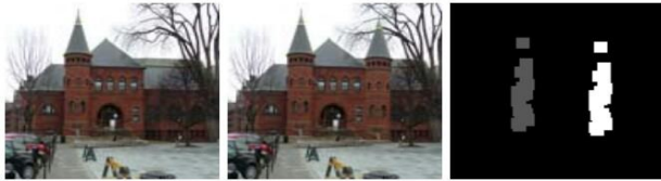
Figure 5.3: Forgery detected by the Robust Match Method

Figure 5.3 shows a forgery that could not be detected by the Exact Match technique.