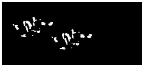
Figure 3.1: Copied and pasted regions in the forged images image 1.1

The Exact Match algorithm was implemented using MATLAB software. Eighty images obtained from various sources were used for testing the algorithm. Color images were converted into grayscale. Images were resized to 128 \times 128 pixels. Blocks of size of 8 \times 8 pixels were considered. Duplicate regions found by matching blocks found in the forged image 1.1. are shown in the figure 1.2.