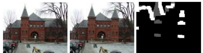
Figure 3.2: Original image(left), Forged image(middle), Result of exact match algorithm with a block size of 3 \times 3

Discontinuities in the detected regions may be due to some retouching operation done after the forgery. But, if the forged image had been saved as JPEG, many of identical blocks would have disappeared because the match would become only approximate and not exact. Figure 1.3 shows a forgery that could not be detected with a block size of 8 \times 8 as retouching has been done after forgery. However when the block size was reduced to 3 \times 3 , some blocks are shown as forged but many are false matches.