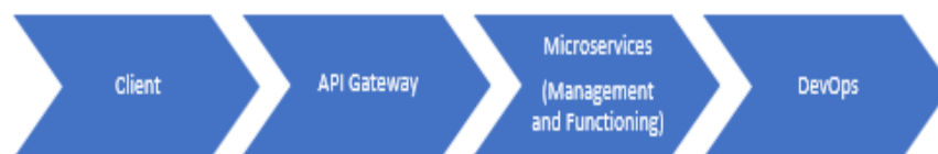
Figure 1: Microservices Architecture workflow

Integration of DevOps is more often than not challenged due to complex nature of existing systems. DevOps aims at simplifying workflows using best in class paradigms and practices. To maximize throughput across versions microservice architecture (MSA) is used. MSA plays a pivotal role in development of lightweight services that are in line with the business needs [5]. MSA improves the agility, developer productivity, software scalability, robustness and maintainability of applications. [6] MSA architecture is ideal for changing requirements like those implemented using agile methods. The high level MSA architecture workflow is shown in figure 1.