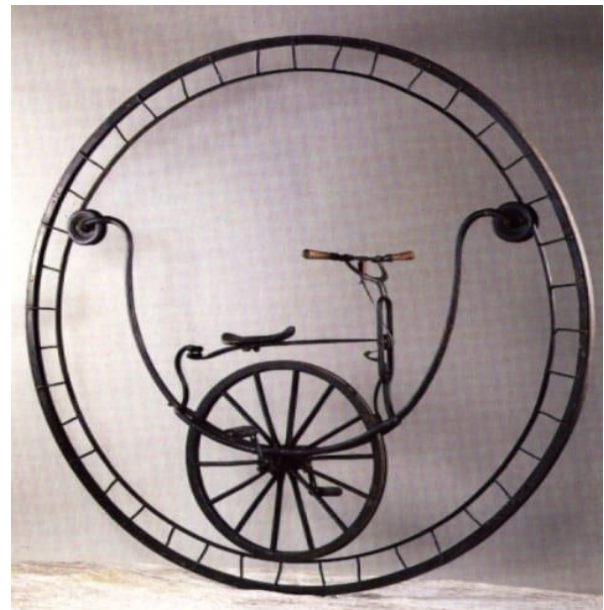
Fig 1: Old Mono Wheel Bike.

The engine is a 90cc four stroke from a Chinese quad bike. The quad engine is fully auto with electric start. The friction drive wheel is the rear wheel from a mini motor. It has a cable-opera.