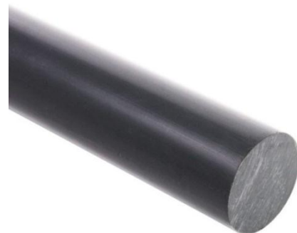
Fig 6: PVC Rod