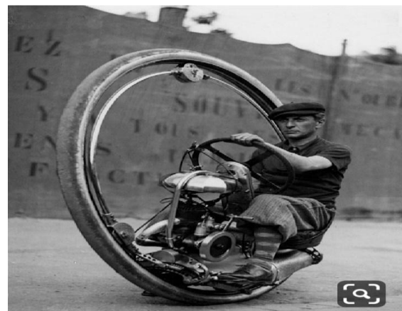
Fig 2: Old Mono Wheel Bike.