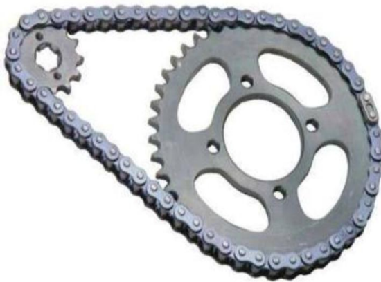
Fig 7: Chain Sprocket

We are using bike engine, i.e. normal petrol engine Specification of engine