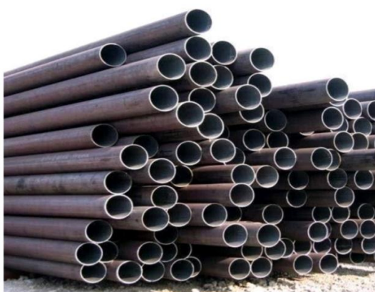
Fig 4: MS Pipe (Circular)