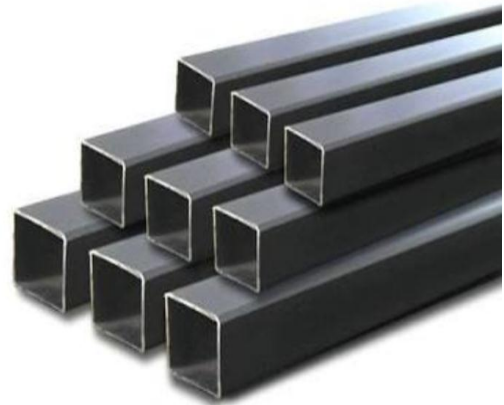
Fig 4: MS Pipe (Square)