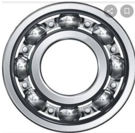
Fig 7: Ball Bearing