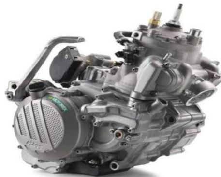
Fig 5: Engine