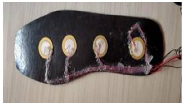
Fig -2: Piezo Sensor

We have used piezo sensors to count the steps user have stepped. There are four piezo sensors attached to the inner sole. If two of them are senses the pressure then it is said that the user has stepped a step. Like this approach, we are counting the steps of the user. Whenever a step is sensed a counter is increased and this is sent to the cloud server. Cloud server stores this information and this information is displayed on the mobile application.