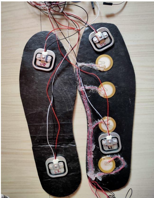
Fig -4: Load Cell

We are using a 50kg half-bridge load cell to calculate the weight of the user. These load cells are connected to an amplifier to amplify the voltage pulses. The amplifier is connected to Arduino nano which amplifies the load cell's voltage pulse and sends it to the microcontroller. The output of the amplifier is then calibrated to get the accurate weight of the user.