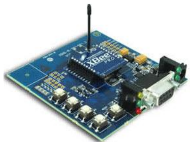
Fig -4: Zigbee Module

Nowadays zigbee is becoming very widely known for wireless applications with low data rate. Zigbee communication is specially designed for IEEE 802.15.4 control and sensor networks for wireless personal area networks (WPANs) and is a product of Zigbee Alliance. This integration model describes the physical and media access