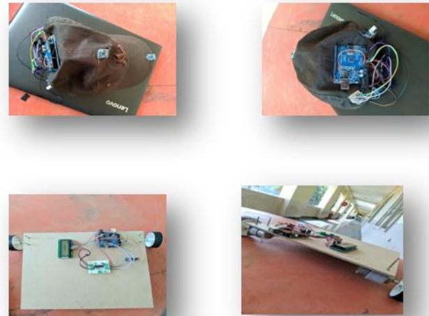
Fig -5: Results

As the rider puts his head back, the wheelchair goes on. By pushing the head forward, the seat shifts backwards. If the operator's head is turned automatically, the wheelchair switches to the right. Likewise, to incline the head to the west, the wheelchair switches straight.