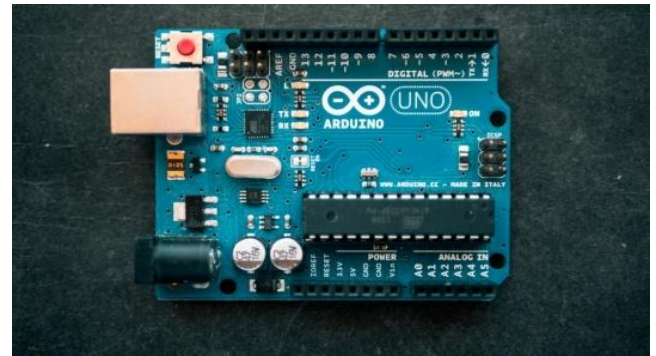
Fig -3: Arduino UNO

The Arduino Uno is an open-source microcontroller board built on the Microchip ATmega328P microcontroller created by Arduino.cc. The board is equipped with a set of digital and analog input / output (I / O) pins that can be connected to various expansion boards (shields) and other circuits. The board has 14 digital I / O pins (six capable of PWM output), 6 analog I / O pins, and is programmable with the Arduino IDE (Integrated Development Environment) with a USB type B cable. It can be operated by a USB cable or an external 9-volt battery, even though it allows voltages between 7 and 20 volts. It's similar to Arduino Nano and Leonardo, too.