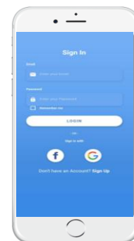
Fig -2 Creating Account

E. Data Storage: Data about sell, purchase, products, services, payments, delivery and business is stored in database. Data warehouse or database is used by organization for storing data.