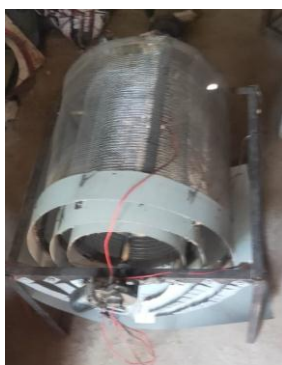
Figure 2. Trommel Assembly.

In trommel three sieve were kept. There are screen three particles aggregate high grade, medium and fine. Grade to operate 1-12 degree (0) of inclination,