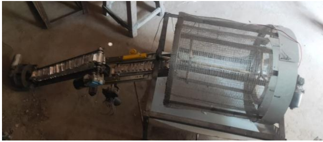
Fig, 3&4 Inclined Trommel Sand Sieve Machine.

It shows the fabrication of sand sieving machine to cover its part. Consisting trommel and conveyor as main part rotary screen i.e. trommel screen is the mechanical screening machine used to separate sand into different grades all components are connected to each other using proper mechanism.