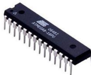
Fig 5.1: ATmega Microcontroller

Atmel Corporation manufactures ATmega microcontroller and it belongs to AVR family. It is based on Harvard Architecture and an 8-bit microcontroller with Reduced Instruction Set (RISC). The standard features on ATmega microcontroller are data EEPROM, on-chip ROM, Data RAM, Serial Interface Ports, Timers and Input / Output Ports, along with extra peripherals like Analog to Digital Converters (ADC). It has more number of instruction set and the program memory ranges from 4K to 256K Bytes.