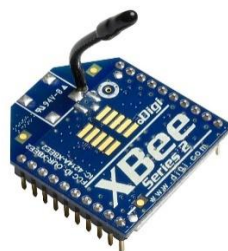
Fig5.5: ZIGBEE Module

ZigBee is supposed for devices which require simple wireless networking and don't need high data transfer rate. These devices may be for example sensor network, information displays, home- and industrial automatic systems, etc. Main benefit compared with Bluetooth is lower power demand, quick respond from sleep to awake and price. ZigBee works in most cases at 2.4 GHz radio band frequency with data transmission rates from 20 to 900 kb/s. ZigBee protocol supports different types of network like star, tree and generic mesh. Network nodes can have different roles like coordinator, router or end device.