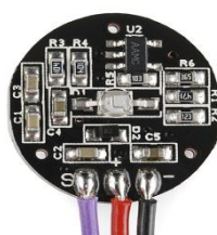
Fig 5.2: Pulse sensor

Pulse Sensor could also be a well-designed plug-and-play heart-rate sensor for Arduino. The athletes, students, artists, makers can use the pulse sensors and the live heartbeat rate data can be easily incorporated into their projects database by mobile developers. The sensor can be placed on the fingertip or earlobe and with some jumper cables it is plugged with the Arduino. It is an open-source monitoring app that can able to graph the persons pulse in real time.