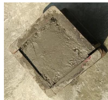
Fig -3: Cube casting

The standard size of cube specimens, cylinder specimens are 150x150x150 mm and 150Φ and 300 mm length. Cubes, cylinder were tested for their compressive strength. Inner sides of the each mould were coated with one coat of shuttering oil for de-moulding the specimen easily. The design mix concrete as well as prepared and filled with moulds in layer by layer, with a thickness of 5cm. each layer was compacted manually by using bullet headed tamping rod. Top layer was finished and levelled uniformly by using trowel to coincides with top level of mould. After 24 hours the casted specimens were de-moulded and then immersed in water tub for 24 hours, the casted specimen curing upto 28 days. The water for curing should be tested every 7 days and the temperature of the must be at 27+ - 2°c.