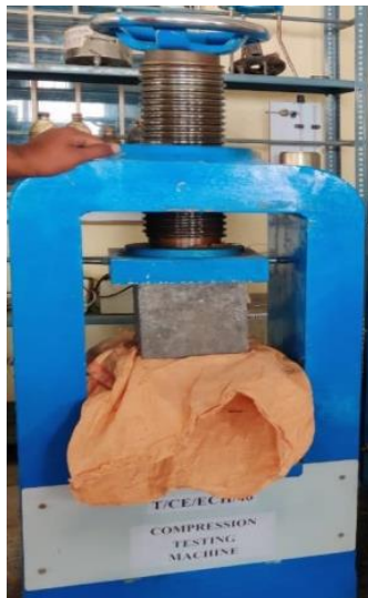
Fig -5: Cube testing