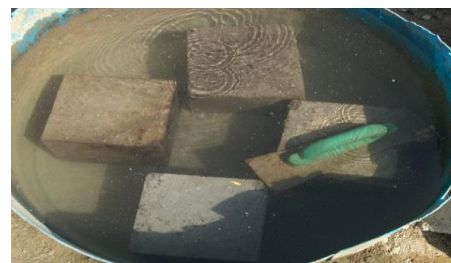
Fig -4: Curing of concrete cube