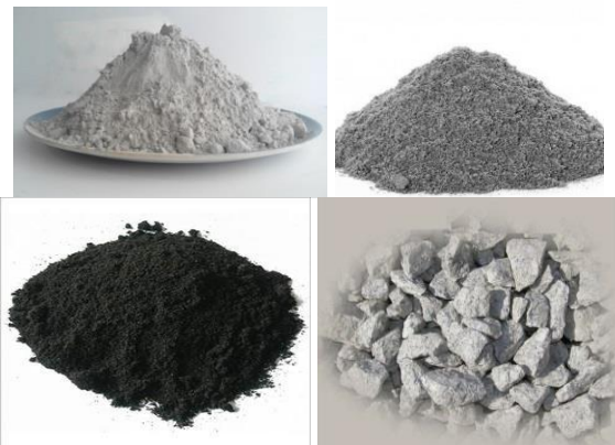
Fig -2: Materials