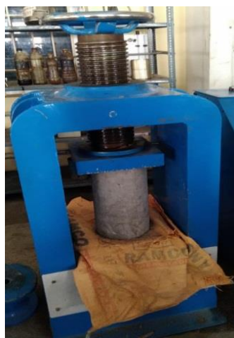
Fig -6: Cylinder testing