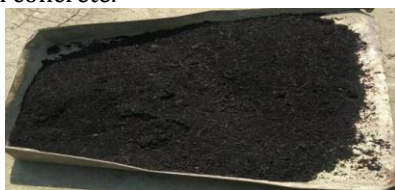
Fig -1: Rubberized asphalt

Rubberized asphalt concrete also known as asphalt rubber or just rubberized asphalt is noise reducing pavement material that consists of regular asphalt concrete mixed with crumb rubber made from recycled tires, asphalt rubber is the largest single market for ground rubber in the United States. Over these years, disposal of waste tires has become one of the most serious environmental issues. To alleviate this problem, new green materials are being developed using recycled tire rubber, with one example being rubberised concrete in which rubber crumb replace some of the fine aggregate in concrete.