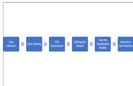
Fig -1: Proposed System

The proposed system begins with the data collection stage which is required in order to train the classifiers. Machine learning approaches, use a set of training data and based on the statistical properties, learn a prediction function to classify a URL as malicious or benign. This gives them the ability to generalize to new URLs unlike blacklisting techniques. The primary requirement for training a machine learning model is the presence of training data. In the context of malicious URL detection, this would correspond to set a large number of URLs. The system allows the user to identify between spam or benign URLs on the basis of the predictions made by the models.