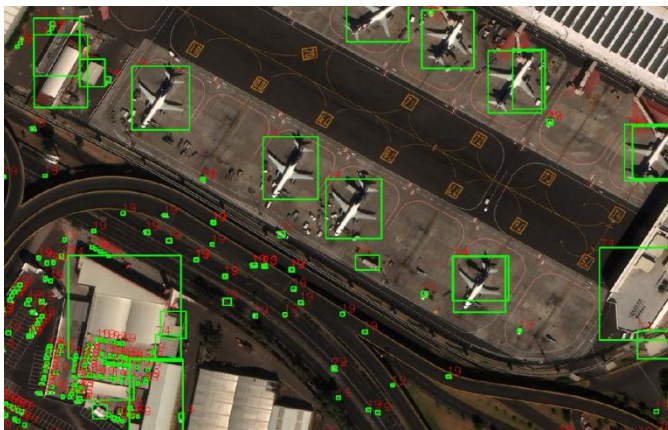
Fig -2: Image after detection