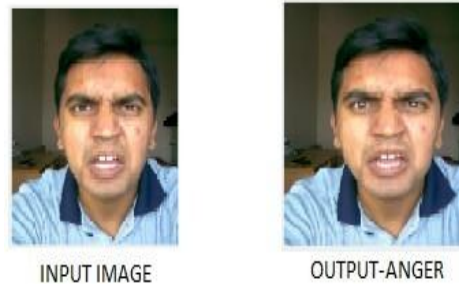
Fig -4: Input-Output

As per the above table, we have taken 60 test images and 44 testing images. We got better results as 99.99 percent for happy faces. Other faces got results between 85 to 90 percent. Overall we got 93.25 percent accuracy.