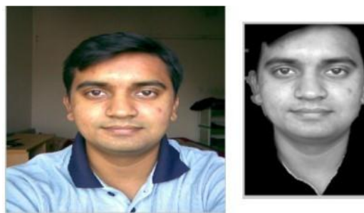
Fig -3: Greyscale Image

Preprocessing: preprocessing of the image is necessary to eliminate unnecessary parts in the input image. Face cropped images are color images. If RGB image converted into the greyscale, then increment in processing as well as less storage.