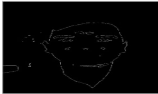
Fig -2: RGB Image