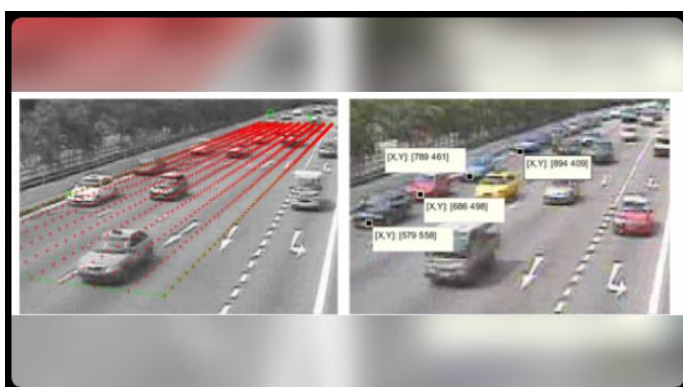
Fig 01: Example of Automated Trajectory Extraction.