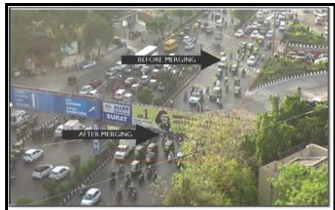
Fig 03: Example of Semi-Automated Trajectory Extraction.