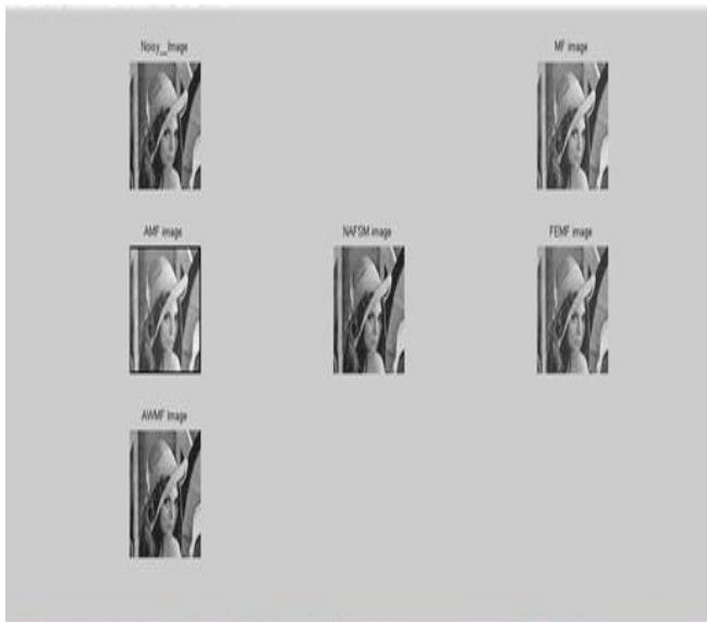
Fig -1: Image_2

I have applied different filters on this noisy image and the output window will be like,