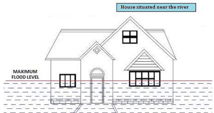
Fig 1.6 House situated in flood area

The figure 1.6 shows the ideal house situated near the river area. The flood water generally not reaches up to this area but when flood takes a huge incarnation which is unexpected. The area which is belowing the maximum flood level gets affected. As the flood water get spread over the long area it makes sever effect on the houses and shops which comes under.