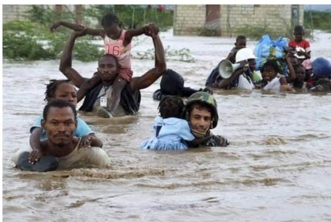
Fig1.5 Pulling out the people trapped in the flood