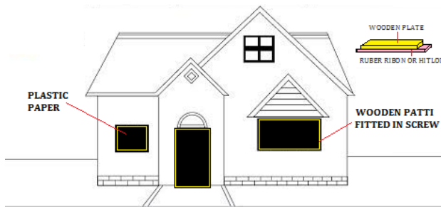
Fig.1.8 House packed by plastic paper