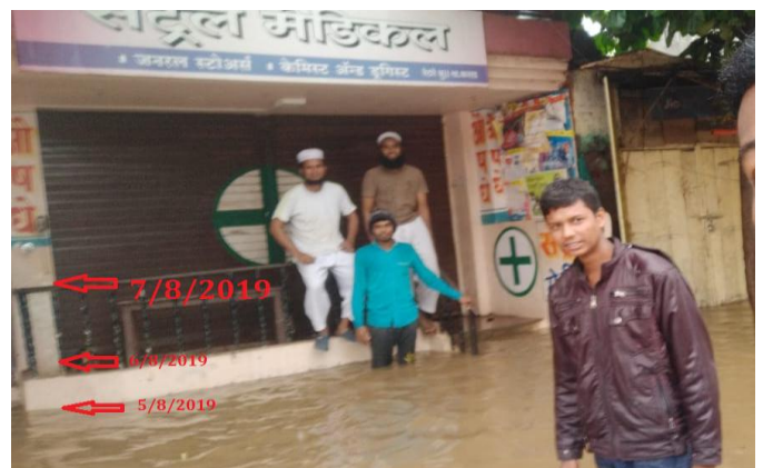
Fig 1.2 Water level mark