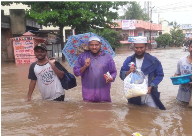
Fig 1.3 Migration in flood