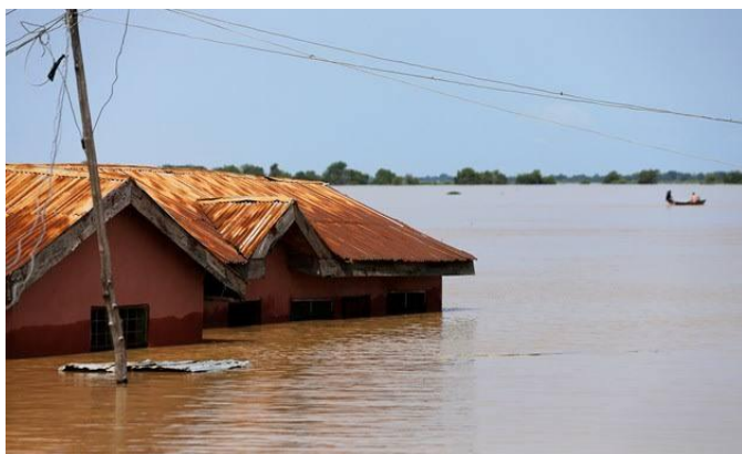
Fig.1.4 Flood effect in other area