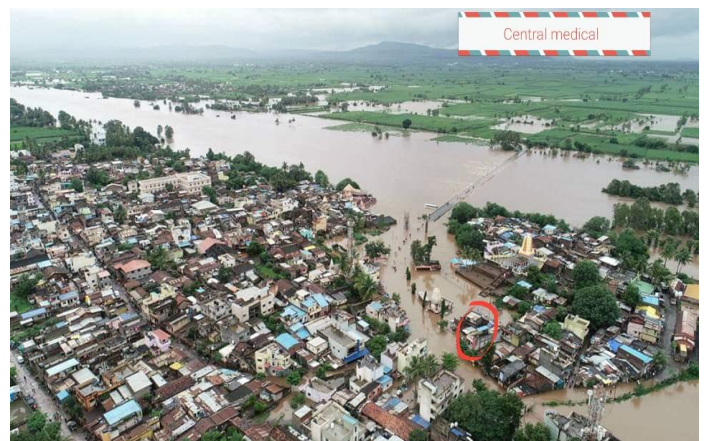
Fig1.1 Flood in 2019 at Rethare BK, Tal: Karad

The following images show the strength of flood. The Fig.1.1 shows the spreading of flood water in locality. The circular area is our firm which comes under water about 3 feet.