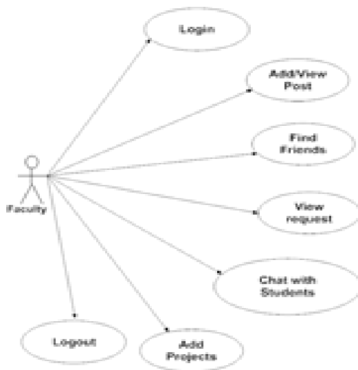
Figure 3: Faculty's actions