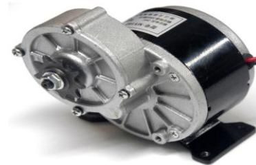
Figure: Dc Motor

Motor is prime mover of driving mechanism through which scrubber is rotated and clean dust beside the road. For efficiently scrubbing of dust from road we selected 24V Geared DC motor having 97.8N-cm Rated Torque. This motor is operated by Battery.