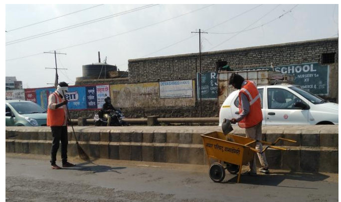
Figure : Manual Process