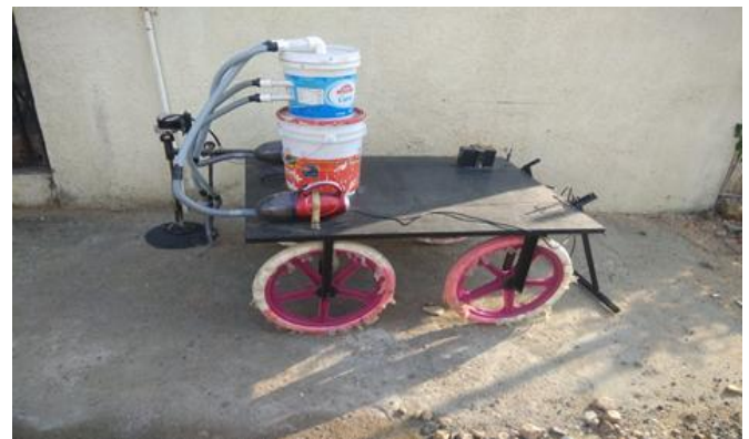
Figure: Dust Cleaning Machine

The efficiency of cyclone dust collection is 66.69 %.