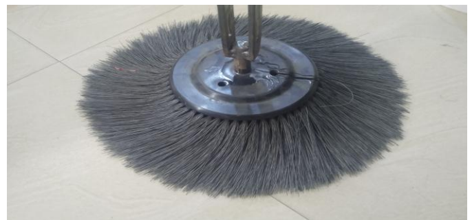
Figure: Scrubber Brush

The scrubber brush is another main component our machine which is directly connected with motor through spindle shaft and rotated at motor speed. Scrubber brush is provide the sweeping action which clean dust beside the road divider.