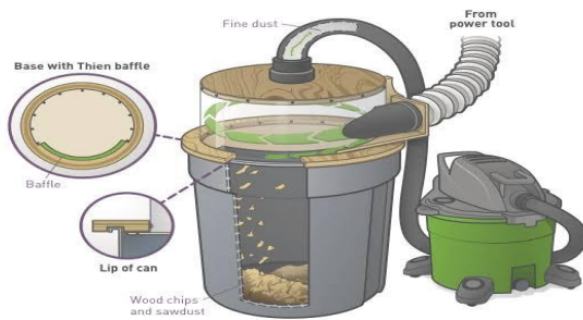
Figure: Cyclone Vacuum dust Collector

drives the heavier particles, fines and dust outward towards the wall of cyclone chamber. They hit the wall lose velocity and fall down into the collector tank.