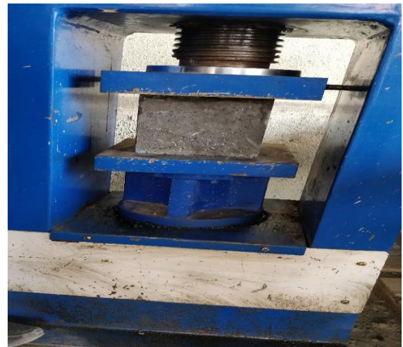
Figure 2. Testing of concrete cube using CTM

Compressive strength (N/mm 2 ) = load applied/cross sectional area of cube