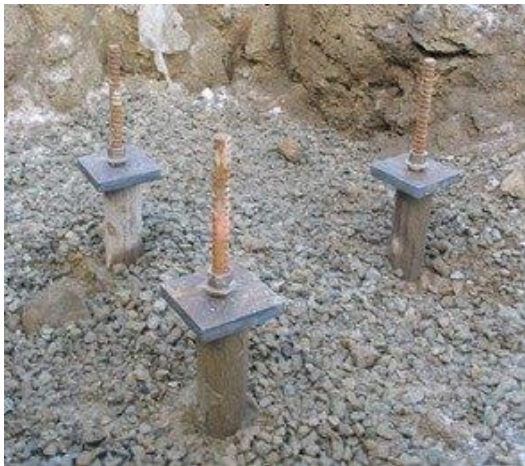
Fig-3 Installation of micropile