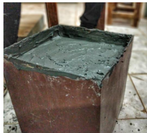
Fig 5- Kuttanad clay