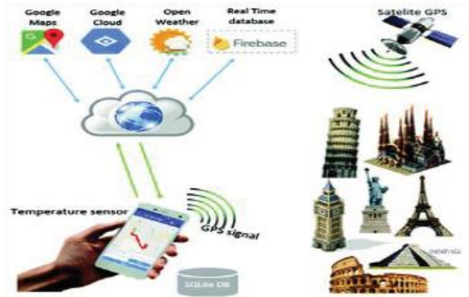
Fig -4: Illustrates Mobile Application to Encourage Local Tourism with Context-Aware Computing

framework the board and organization from a solitary substance (for example a regional government). It also diminishes the danger of expanding heterogeneity, which is probably going to set in when various partners use their own calculation framework for information assortment and preparing related exercises.