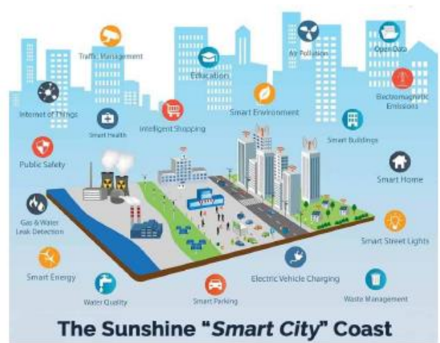
Fig -1: Illustrates a smart city features

exceptional people. For a couple, it is one more approach for portraying IT (facts advancement) "re-appropriating"; others use it to intend any figuring organization gave over the Internet or a tantamount system, and some symbolize it as any bought-in PC management you utilize that sits outdoor your firewall. You can get to your records from a propelled cellular phone, a tablet, a PC, or a work territory wherever you've got an Internet affiliation. Distributed computing is an on-demand agency that has won mass interest in corporate server ranches. The cloud enables the server home to work just like the Internet and figuring advantages to be gotten to and shared as digital assets in a sheltered and bendy manner. Like maximum advancements, designs start within the endeavor and pass to project via personal companies.