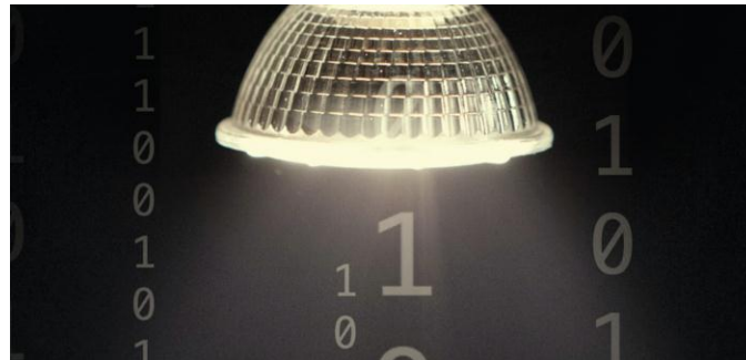
Figure2. Data transmitted in the form of binary bits '1' and '0'

Figure1 shows the basic working of Li-Fi. The data is transmitted by the transmitter in the form of binary bits 1 and 0, which is transmitted through an LED light connected to it. The LED driver then rectifies the higher voltage, alternating current to low voltage, direct current. The on-off activity of the LED transmitter enables data transmission in the form of light with the incoming binary codes: switch 'ON' means that the transmitter is sending '1', and switch 'OFF' means that signal '0' is transmitted. The rate of flickering of the LED signal is so fast that it is unnoticed with the human eye and by varying which a different output can be obtained in the receiver. {An example of the signal send is shown in figure2}. The receiver in the form of a photodiode (a light detector) detects the light coming from the LED which is then amplified, processed, and received by the receiver connected to the output.