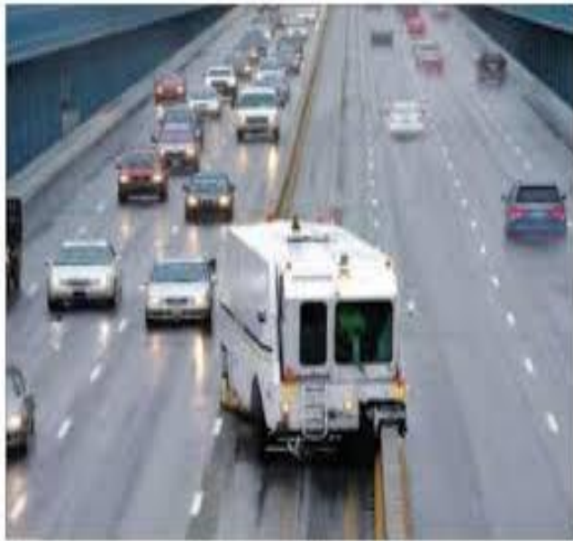
Fig -1: Working of existing system

Zipper machines or road zipper which is put together referred to as barrier transfer machines, unit of measurement vehicles are normal transport material lane road divider like Jersey wall, the measurement unit of normal soften delay all over the busy hours. Various areas concisely throughout the building work. Lanes which are constructed by the tools are usually termed as zipper lanes. The gain of these systems on top of various managing systems such as coned, directing light above solid systems. A practical barrier avoids the accident as a result the traveller overlap the other side of traffic. The disadvantage using this existing system is that the width of the lanes is slightly reduced.