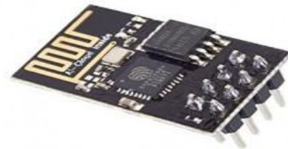
Fig -3: ESP-01 module

The system is specifically for the wearable electronics, mobile devices and the network application structure.