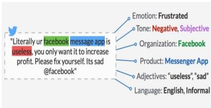
Figure 1: Understanding Language

syntactic structure are responsible for meaning extraction from input. Next step is discourse integration where the meaning of sentence is tried to extracted using the previous sentence meaning. Final step is pragmatic analysis. In this analysis, the main emphasis is on what was said is reinterpreted on what does it actually meant. After all this steps the meaning of sentence is known to machine and it finds answer to user query and passes it to Natural language generation (NLG) for generation of final output. Natural language processing (NLP) is used in many chatbot for effective communication with humans. Below figure 1 shows Basic working of chatbot using Natural language processing (NLP).