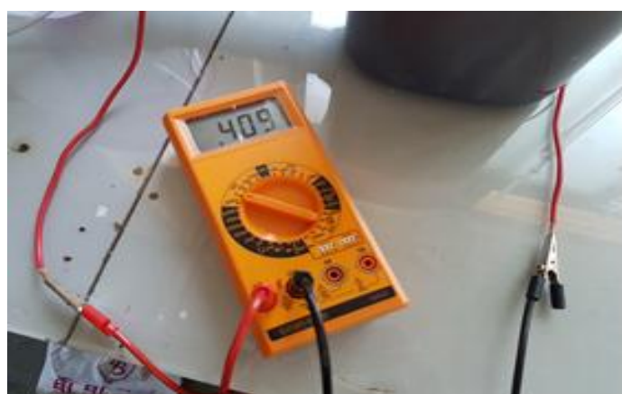
Fig -4: Multimeter reading of day 1