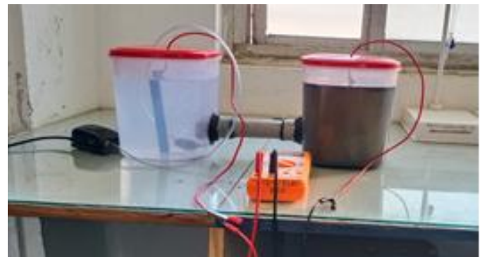
Fig -3: Model of Microbial Fuel Cell

The Salt Bridge is made using water, agar agar powder, and salt. 300ml of water is boiled till 5 to 7mins, then 10% of Agar Agar powder is mixed till the powder is fully dissolved. After the powder is totally dissolved, 6g of salt is added to the mix after turning off the burner. After 4 to 5mins, the solution is then poured into the PVC pipe as shown in Figure 2. The thick gel is formed know as salt bridge which helps to transfer hydrogen ion to cathodic chamber.