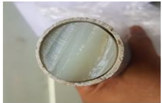
Fig -2: Salt Bridge

The H-type MFC consists of two chambers, firstly the anaerobic anodic chamber and second is an aerobic cathode chamber. These two chambers were connected by using a salt bridge. Two electrodes are nothing but the graphite rods dipped into the solutions. These two graphite electrodes were separately joined to copper wires which were clamped on crocodile clips. Figure 1 shows the schematic diagram of a H-Type Microbial Fuel Cell. The anode chamber is filled with 4L of sewage (Bio waste) wastewater while; the cathode chamber was filled with 4L of distilled water. The copper wires from these two electrodes are then connected to a digital multimeter to show the generating electricity in volts. Once the MFC shows a repetition in the voltage readings, the anode chamber can be refilled with fresh wastewater and the process can be repeated.