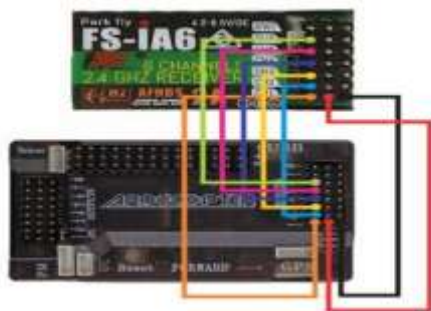
Fig-3: Interfacing with receiver