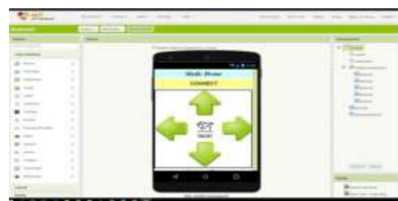
Fig -6: Layout of Medic Drone Application

To control drone through Bluetooth by using smartphones, we have developed an Application named as ‘Medic Drone’ for smartphones using MIT app inventor. It's a open-source and free software originally provided by Google, and now maintained by the Massachusetts Institute of Technology (MIT). It uses block coding method which allows users to drag and drop visual objects to make an application which will run on mobile devices. Through this app user can control flight operation of drone through Bluetooth. The each button in the app is programmed for UAV to move on up, down, left, right, forward and in backward directions using block coding programming method.