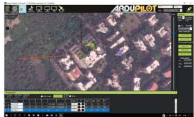
Fig -5: Waypoint selection of Autonomous flight