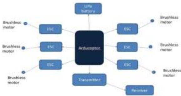
Fig -2: Block diagram of Manual flight operation