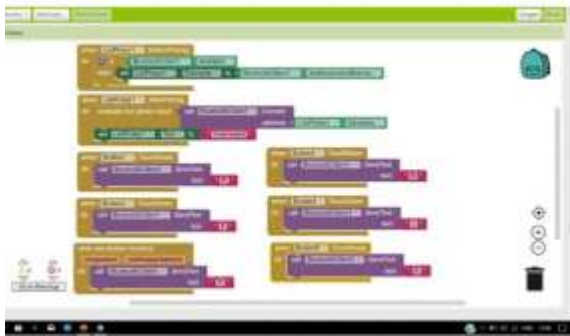
Fig -7: Block coding of Medic Drone Application