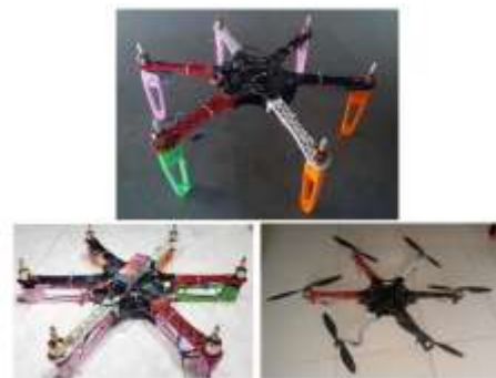
Fig-1: Actual system

In many countries, delivering medical supplies like vaccines and medicines by road transport is very time consuming and also use of air transport like a helicopter is extortionate therefore drones are a very affordable alternative to any transport just in case of medical emergencies. The facility of drones to accumulate real-time, high-resolution temporal, spatial information, Fast reaction time and thus the power to navigate at low cost makes them viable and attractive medical delivery platform.