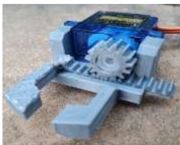
Fig -8: Module for Pick and Drop function

UAVs can be used for medicine, vaccine, blood package delivery and medical emergencies, etc. In this system we are adding a new function pick and drop which can be used for Hospital delivery, to carry small emergency medical equipment and medical to deliver medical supply in remote areas. In this system we are using two separate modules, one for pick and drop and another for less than drop function. This function can pick any medical equipment such as defibrillator, blood samples or any other object of maximum load of 1.5kg and can drop it wherever it is desired. In emergency conditions where ambulances can't reach due to traffic this function can be used for drop facilities by using separate modules which can lift any payload such as medical equipment, blood samples up to 1.5kg.