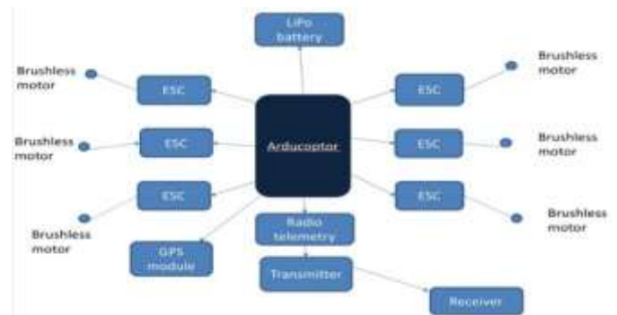
Fig -4: Block diagram of Autonomous flight operation using GPS