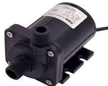
Fig.3: DC water pump

A pump is a device that moves fluids or at times slurries, by mechanical act. DC powered pumps utilize direct current from motor, battery, or solar power to shift fluid in a variety of behavior and small in dimension and size.