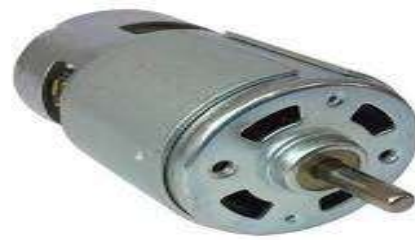
Fig.2: DC Motor

A DC motor is an electric motor that runs on direct current. A . The DC motor is 30% more efficient than AC motors due to the secondary magnetic field being generate from the lasting magnets slightly than copper windings. It prefer copper winding.