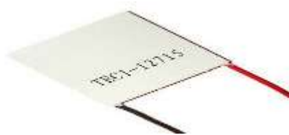
Fig.1: 12715 Peltier Module

The Peltier elements, which are also called thermoelectric modules or TEC, are an electrically operated heat pump. Here, energy in the form of heat is transferred from one side of the module to the other side and has to be dissipated there. The Peltier module is based on the so-called Peltier effect.