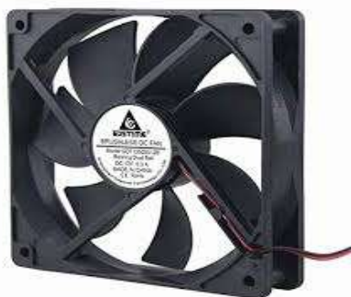
Fig.8: DC Fan

The direct current fans, or DC fan, are power-driven with a potential of fixed value such as the voltage of a battery. Characteristic voltage ideals for DC fans are, 5V, 12V