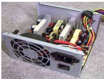
Fig.7: Power supply

A power supply is an electrical device that supply electric power to an electrical load. The main function of a power supply is to convert electric current from a source to the right voltage, current, and frequency to power the load.