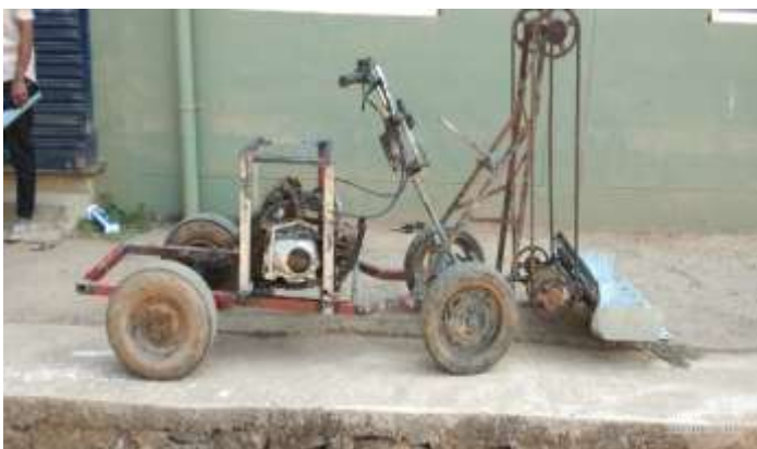
Design of product

Cleaning brushes use bristles, wire, or other filaments to dust, scrub, and remove deposits from objects and surfaces. They are commonly used to scrub and clean kitchens and bathrooms, spot dust and clean, and remove metal, paint, and residue from equipment.