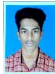
Sobin AP Akkamparambil house, Pulppatta po, manjeri Malappuram, Kerala,