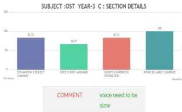
Fig. 6.1: Feedback result of Faculty in Graphical Notation