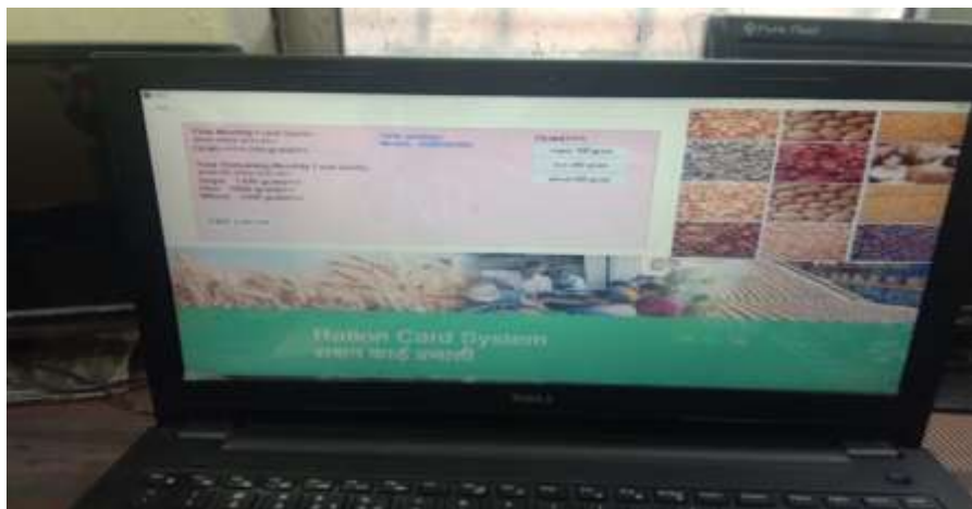
Figure.4: Snapshot of selecting the commodities such as sugar, rice and wheat

hello pradnya your otp is 2988 on date : 3/5/2020 1:40:52 pm/