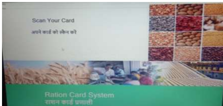
Figure. 2: Snapshot of scanning the digital card