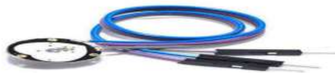
Fig -2: Pulse sensor

Pulse Sensor is electronic device which is used to measure the heart-rate. It is provided with some circuitry that allows us to easily interface it with the arduino. It is being widely used by the students, athletes, artist and mobile developers to calculate the heart rate. The sensor is clipped onto a fingertip or earlobe and plugged into Arduino with some jumper cables to read data for further computation[3].