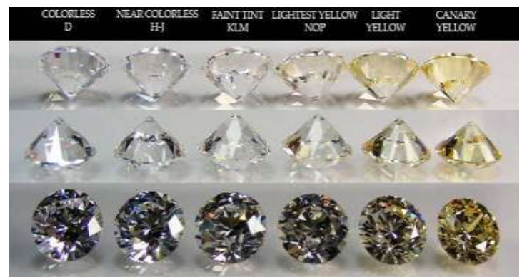
Fig 1- Diamond color grading

well worn, and wronged value acting can be made effortlessly. Therefore, it has become important and challenging research topic to develop an integrated auto measuring system for diamond grading. Suggested system works on diamond quality grading based on color of diamond, texture of a diamond and clarity. In order to get accurate diamond images, a special hardware source is employed. Quality assessment done through three important feature extraction of the diamond like color, texture and clarity. Then extracted features are passed to the classier for grading on the basis of grading quality of a diamond will be determine.